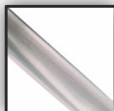
Silver - size 4+5