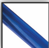
Blue - size 2+3